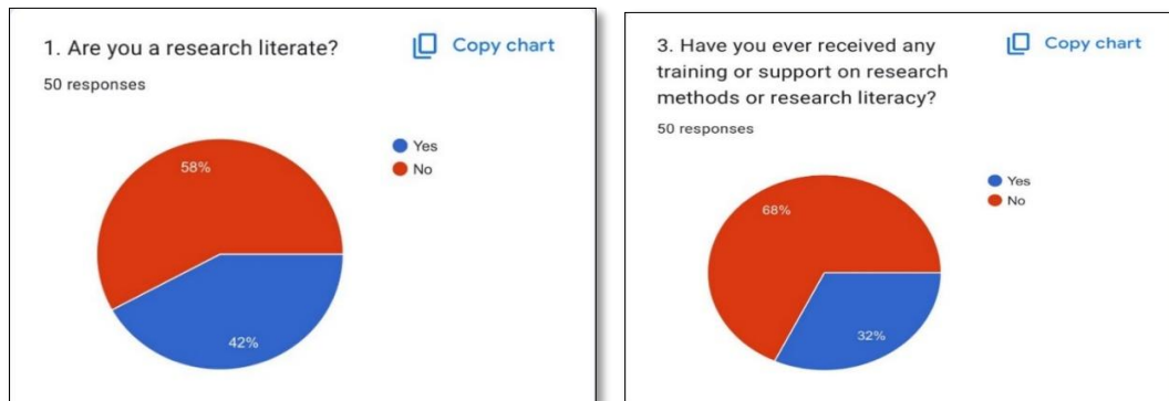
Figure 1.1&1.2 Awareness of Research Literacy

From the figure above, it’s evident that the majority (58%) of the teachers are not research literates. Some of them (42%) mentioned that they are research literates. This reveals that the majority of the ESL teachers are not research literates. Hence, it’s important to make the teachers aware of the research literacy so that they can understand the classroom-based problems and find a feasible solution to them. The second figure above also reveals if the ESL teachers received any training or support on research methods or research literacy. The majority of the teachers (68%) stated that they haven’t received any training or support on research methods or research literacy. Some of the teachers (32%) responded that they have received some amount of training and support. It’s, therefore, important that the ESL teachers be given training in research method and research literacy so that they understand the day-today challenges of the classroom and enhance their teaching-learning process in the classroom.